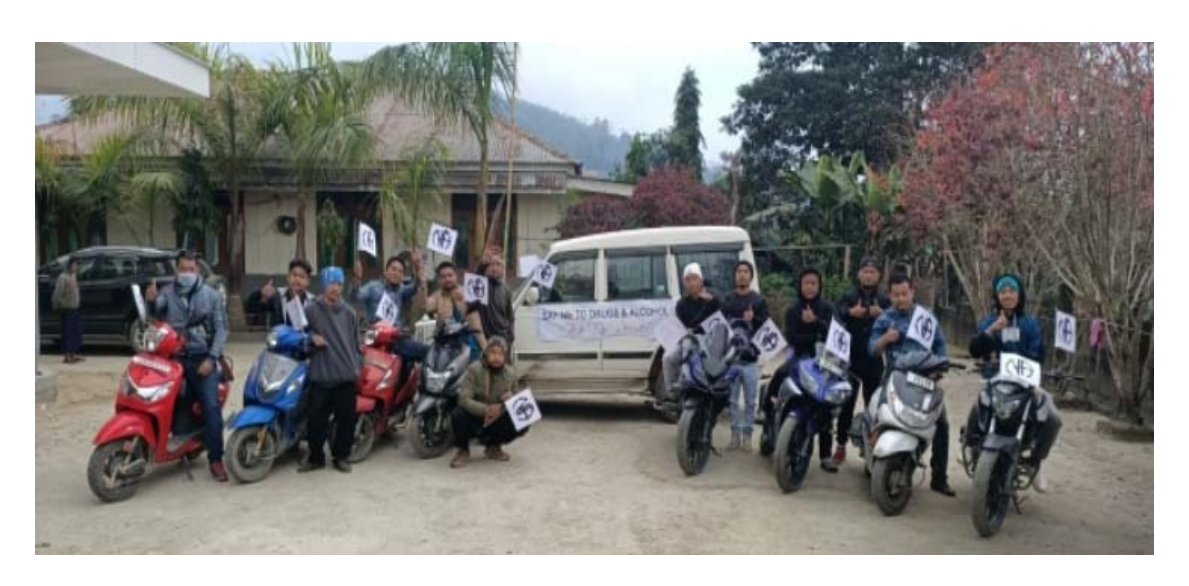
3<sup>rd</sup> Anniversary of 100 Days De-addiction cum Rehabilitation Centre

Dated 31 january 2021 NA-recovery club took out a "say no to drugs and alcohol" parade all around the town. With the theme "we do recover", the objective of the parade was to carry a positive message for those struggling to come out of addiction that is possible